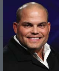
Iván Rodríguez Former Major League Baseball catcher, 2017 Baseball Hall of Fame